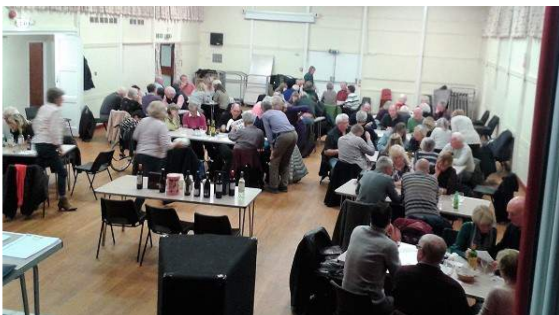
Competitors hard at work on the difficult picture questions

The tickets were priced at £10.00, which included Fish and Chips during a break in proceedings, and with the Bar and ticket profits, after allowing for the costs of the food and room hire, the event raised a total of £846.00. A very good result, and thanks once again to Miles and Carolyn for the enormous amount of organisation work, and to Nick and Lynn for running the Quiz.