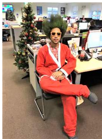
Santa's Little Helper

The current figure for the total raised, including Gift Aid claimed by Everyclick for online donations where appropriate, has reached £52,815.17, and once all of the proceeds from the final event plus some other funding raised are received, we may yet approach a truly amazing final total of £60,000.