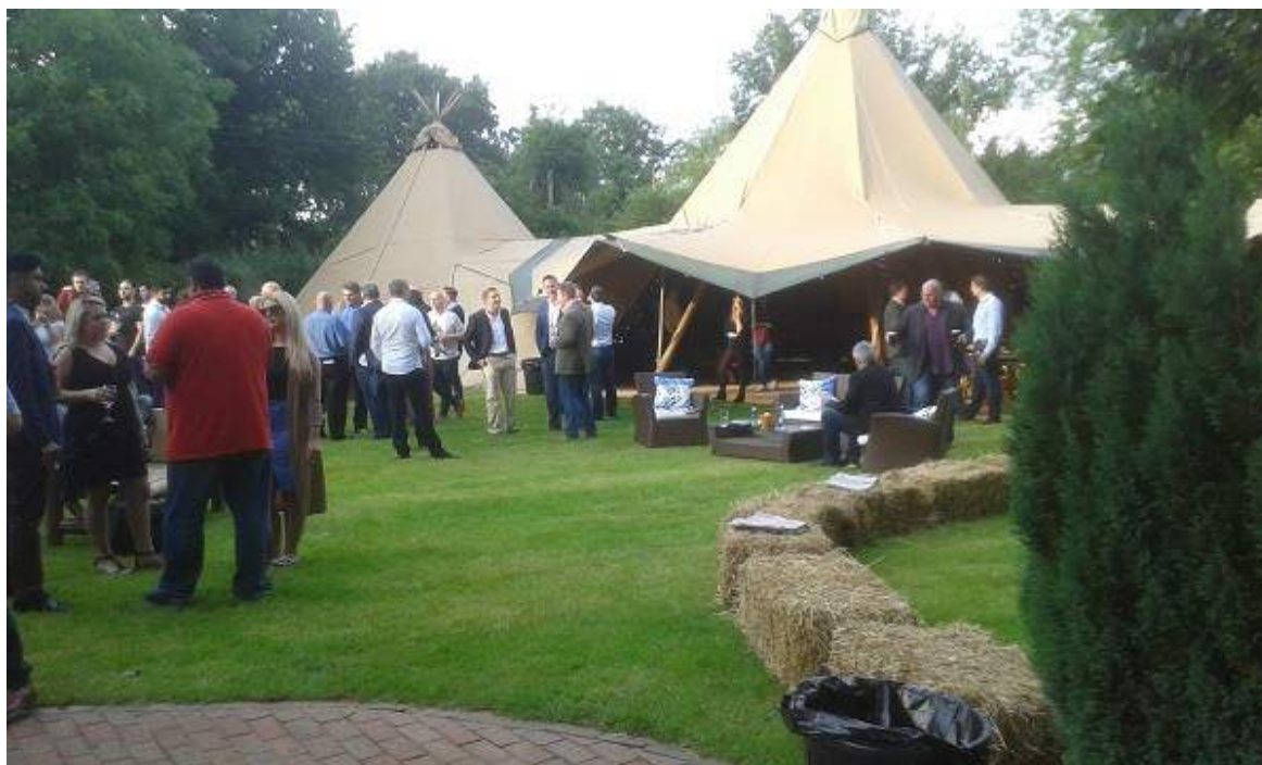
A view of the guests gathering in the large garden, in front of the Poker tent

On Thursday evening 14 th July, Precise Mortgages, a division of Charter Court Financial Services, held their sixth Annual Poker Night event at the home of one of the directors.