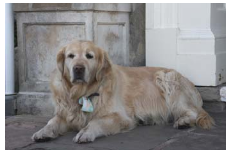
One resident without a ticket on the day