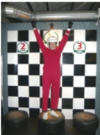
The Chairman seems pleased with a fundraising result

And sometimes involved in the serious business of fundraising itself: