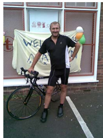
Our Legal Trustee in major fundraising mode. (140 mile sponsored ride)