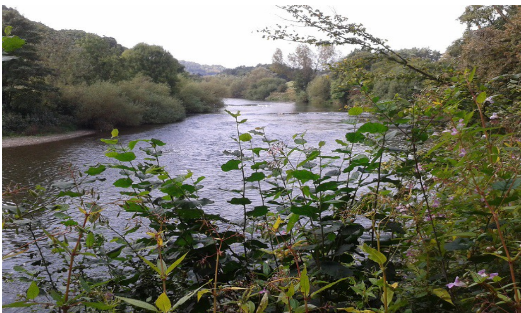
A view upstream walking from Bewdley towards Arley