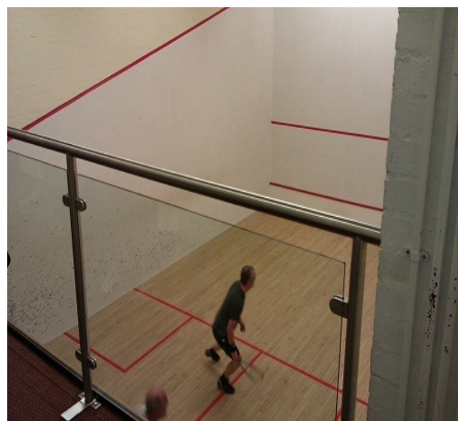
A game in progress