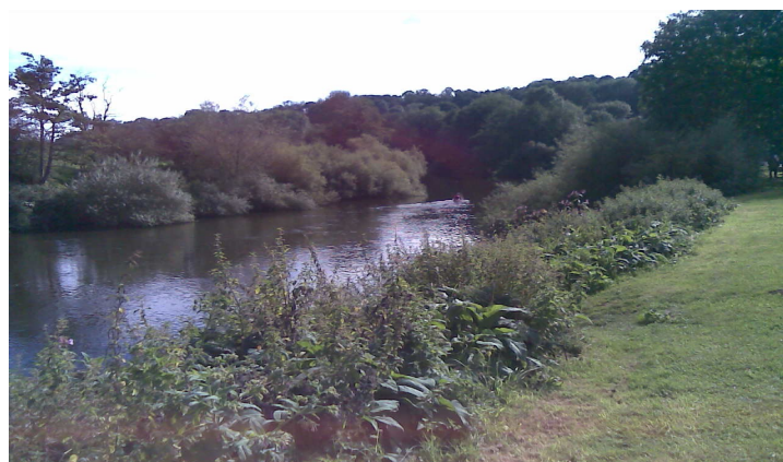
View of the River near Highley

The total raised came to a very useful £420.00, which, with gift aid to be claimed next April, will rise to £525.00. A big thank you to everyone for taking part in a very enjoyable event.