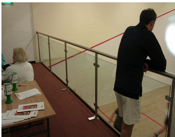
The Marathon in Progress on Court 1

This year we managed to fill all the available time slots for one Court from 9.30 am to 8.00 pm, with a second Court in use part of the time to cover additional demand.