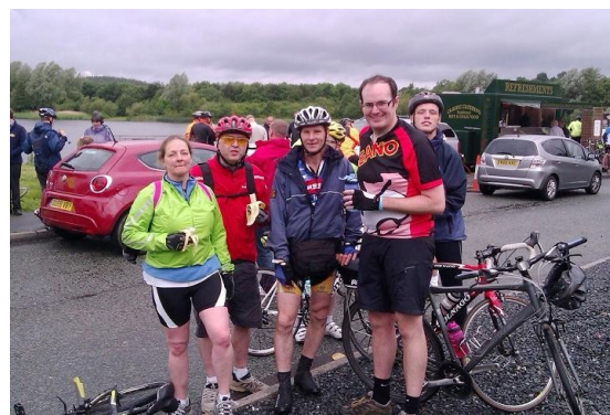
The Team at Checkpoint 1