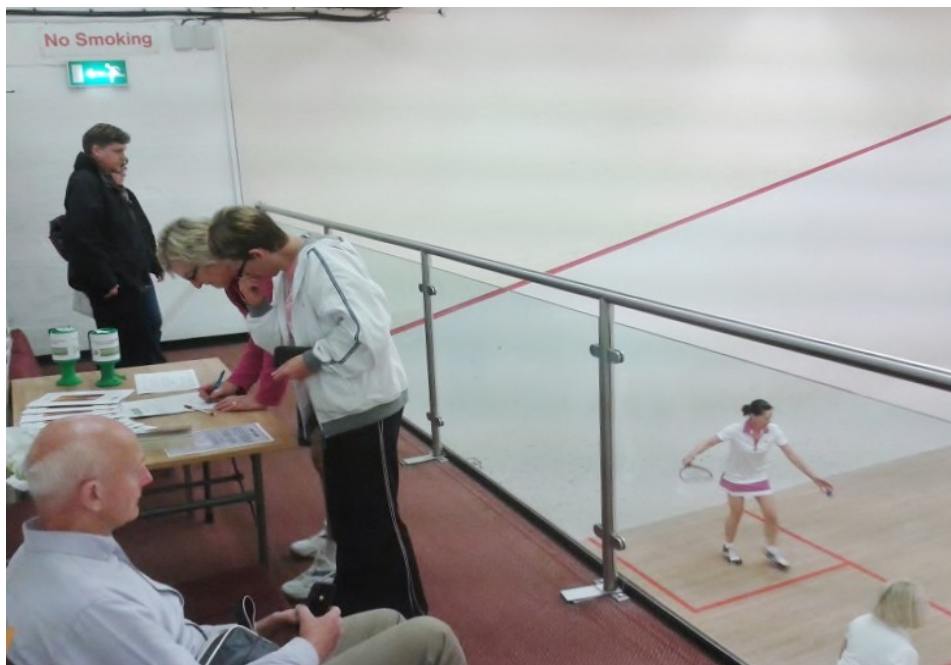
Signing on and watching play on Court 1

Stourbridge Lawn Tennis & Squash Club held their Open Day on Saturday 11th May. Once again, the Racketball Committee very kindly organised a Racketball Marathon for us, which was intended to run from 8.00 am to 8.00 pm. We did finish a little earlier, at 7.00 pm, but during much of the day, two courts were in use, and participants were asked if they would like to make a small donation to the Charity.